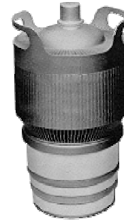
Plate Dissipation (Max.) 5000 W Screen Dissipation (Max.) 250 W Grid Dissipation (Max.) 75 W Frequency for Max. rating (CW) 100 MHz Amplification Factor 4,5 Filament/Cathode Thoriated Tungsten Voltage 7.5 V Current 75,0 A

Capacitance Grounded Cathode Input 115,0 pF Output 20,5 pF Feed through 0,7 pF